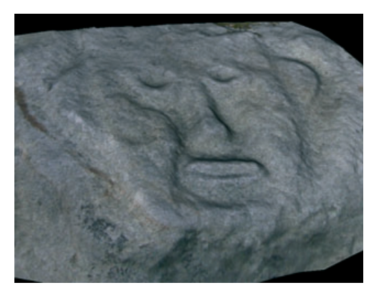
FIG. 5. Draped orthophoto representing rock art.

technique and procedures, that it is now expected that DEMs and orthophotos will be extracted for all but a few less significant sites. The volunteers have also made universal use of the PI-3000 Pro Image Surveying Station software (Topcon, 2006) rather than LPS and have generally become proficient in its use for basic DEM (Fig. 4) and orthophoto creation (Fig. 5). It is expected that all data acquisition will be completed by the end of the project in July 2007, when approximately 12 Gb of project data will be placed on a server. Detailed planning of this phase is yet to be finalised, but general Internet access to some case studies is envisaged.