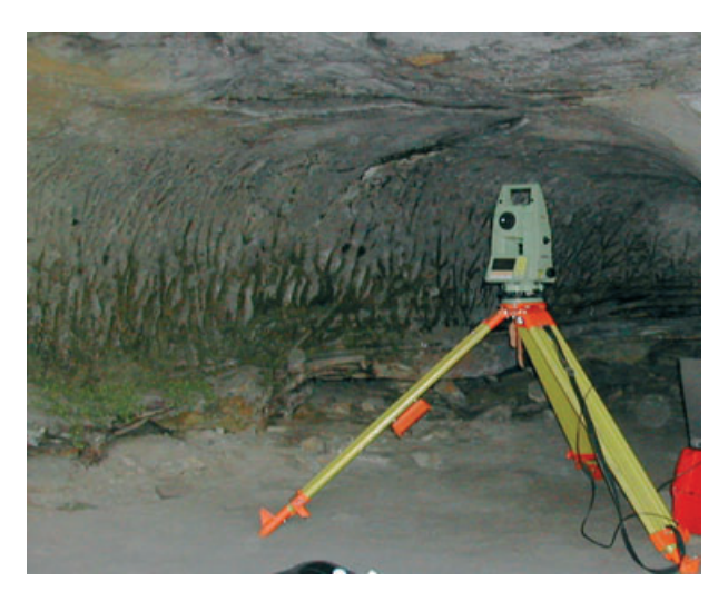
FIG. 2. Emu Cave showing petroglyphs and control acquisition.

Data processing was carried out originally using the Leica Photogrammetry Suite (LPS) (Leica Geosystems, 2005) but any commercial digital photogrammetric software should be capable of creating DEMs and orthophotographs from each stereopair, once satisfactory