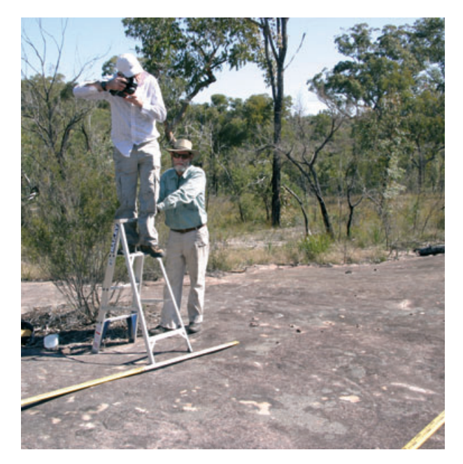
FIG. 1. Image acquisition.

The developed methodology uses the humble stereopair as the basic building block to provide stereoscopic coverage of rock-art sites, suitable for recording both petroglyphs and pictographs. For many simple sites, a single stereopair is theoretically all that is required, but multiple stereopairs provide redundancy, increased coverage and additional viewpoints. Normally accepted "base to distance" ratios need to be maintained, typically between 1:3 and 1:6 if DEM extraction is envisaged. If simple stereoviewing only is required, the recommended base to distance ratio would be between 1:6 and 1:12. Conventional image pairs which are normal to the object (that is, with both camera axes perpendicular to the approximate plane of the object) can be acquired, but the first author has obtained very good results with convergent imagery, provided that the camera axes do not cross. If lighting permits, images can be acquired using a handheld camera (Fig. 1), otherwise a modest camera tripod is required. A