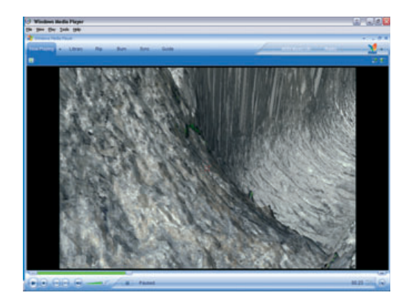
FIG. 3. Fly-through model representing Emu Cave.

(5 megapixel) each costing £240 when purchased in January 2005. In April 2005, the first author ran a one-day workshop in Durham attended by 50 enthusiastic rock-art volunteers. Four presentations were given. The first two described how cheap digital cameras were used to record petroglyphs and pictographs in Australia. This was followed by an explanation of how to acquire appropriate stereo-imagery, emphasising how the base to distance ratio provides a simple guide for success. The final presentation focused on how to use the LPS to extract DEMs and orthophotos (Leica Geosystems, 2005), but also made the point that the stereo-imagery itself could remain the record, rather than any extracted data. The workshop was crucial because it fired enthusiasm, and within weeks the volunteers had begun to go out and acquire imagery. Further advice and encouragement proved necessary and the second author at English Heritage gave support by e-mail and indeed went out into the field to give further instruction over the summer of 2005.